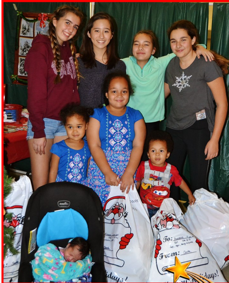
NCL volunteers spreading joy!

CARES partnered with the National Charity League of San Marino, USC Town & Gown , and many other individuals from the community who worked together to create a season of giving for many of the patients who come to the LAC+USC Medical Center for care. These families have many things in common: All the families have children; at least one of the family members is suffering from an illness or injury that has impacted their ability to provide adequately for their family's needs; they have no resources to provide gifts to their children for the holidays; and