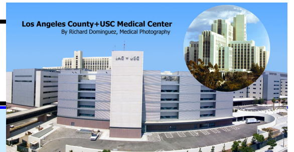
Los Angeles County+USC Medical Center