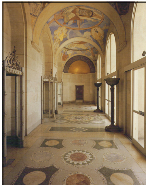
The front entrance of General Hospital has welcomed many to the stately building over the years.

Andy Gero , Chief of the LAC+USC Medical Center's Photography Department for many years, has photographed some beautiful views of General Hospital and many locations in and around the building. Some of these photographs are still available to order and purchase from the CARES Gift Shop to benefit the patients. His view of the entire Medical Center before the new facility was built is available on a postcard as well. The picture of General Hospital shown on the top right of the front page of the CARES newsletter (in the