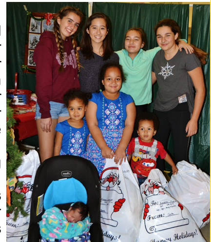
Volunteers from National Charity League of San Marino help patients' children with gifts

Many health situations exhaust all financial resources: a family member suffering from a catastrophic illness or serious injury requires months or even years to recover, the major provider for the family becomes unable to work, or a child who is ill needs home care. The challenges faced are overwhelming. Under such circumstances, covering basic necessities must be the priority, thus making it impossible to bring gifts and a holiday celebration to their homes. The help that CARES provides is a real morale booster for the entire family. By lending a helping hand, CARES lets the patient know that 'someone does care about them.' All of their problems are not solved, however, by providing them with toys, gifts, and food gift certificates, hope for better times ahead is restored.